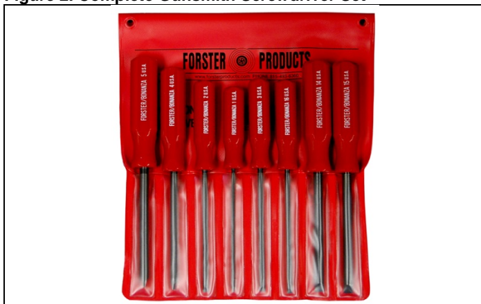
Figure 2. Complete Gunsmith Screwdriver Set